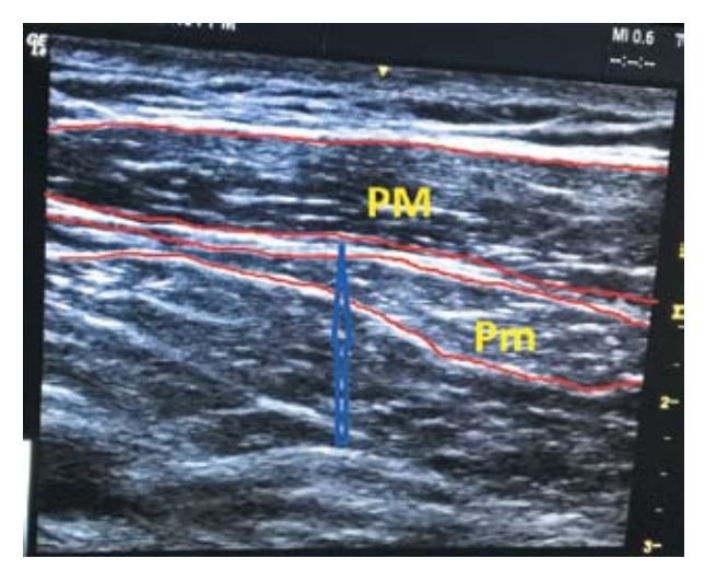
Figure 1: Sonoanatomy relevant to Pec block