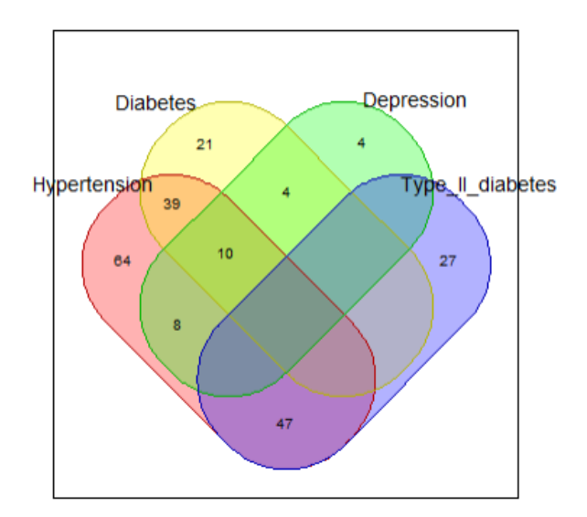
Figure 3: Distribution of patients with confirmed COVID-19 among the top 4 comorbidities

***Patients had none of the listed comorbidities