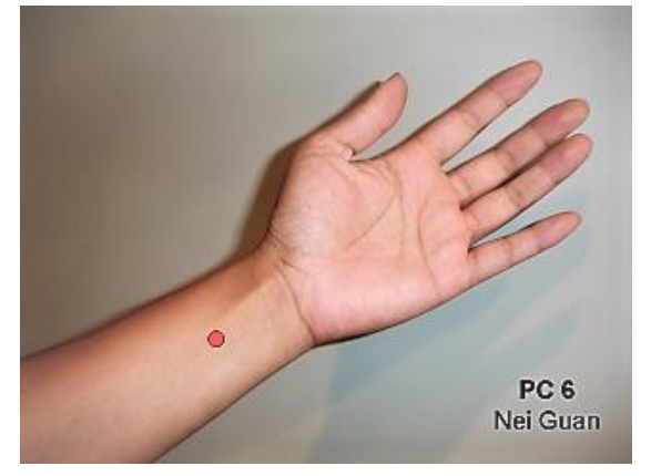
Figure 1: Pericardium point P6

It has been shown that aggressive prophylaxis measures, combined with changes in anesthetic technique, can reduce the incidence of PONV. Currently, pharmacological prophylaxis is widely used in clinical practice however at present no therapy is absolutely effective in preventing PONV. Additionally, medical therapy can be expensive and be associated with many adverse effects.<sup>5</sup> Since it has been established that current antiemetics and anesthetic techniques are not sufficient in reducing PONV, the use of supplemental methods for prophylaxis has become widespread and accepted. These supplemental strategies include hypnosis, acupuncture, acupressure, relaxation techniques, behavior therapy, and guided imagery.<sup>6</sup>