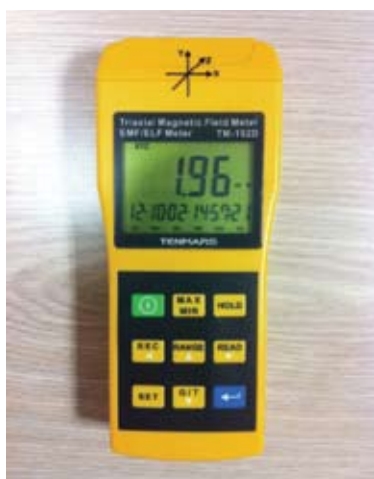
Figure 1: ELF-EMF meter (TM-192D, Tenmars, Taiwan)

This test was designed as prospective experimental study and conducted in an empty operating room of our university hospital. All the electrical equipment including computer, astral lamp, monitors, surgical and anesthetic devices had been put off in the operating room. The intensity of ELF-EMF was measured as two-second interval for two days by ELF-EMF meter (TM-192D, Tenmars, Taiwan) (Figure 1).