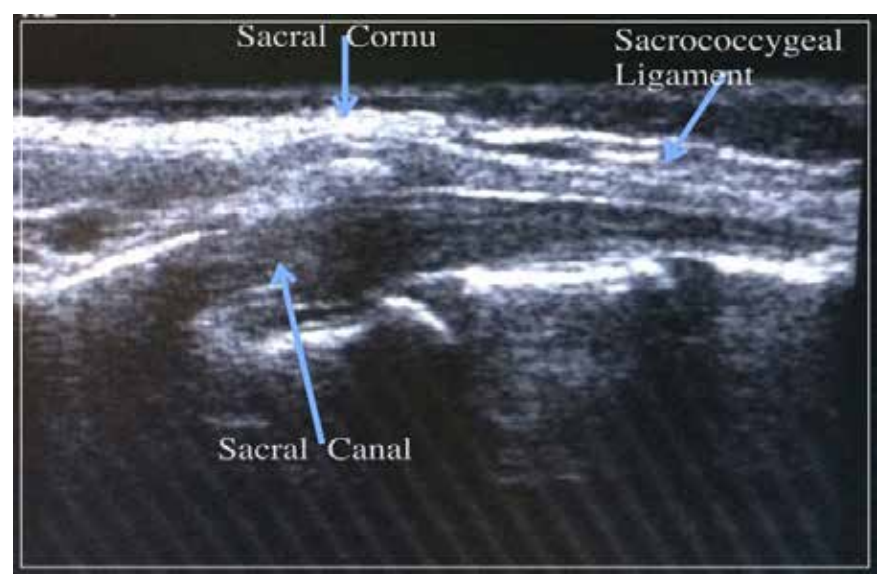
Figure 2: Sacrococcygeal ligament and caudal canal visualised in longitudinal axis